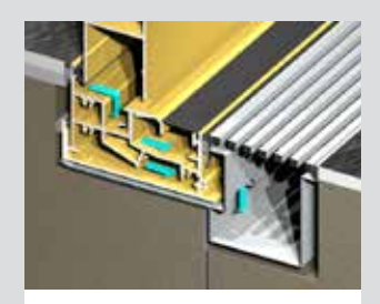
The sill can be recessed into floor finish and fitted with stainless steel drainage system.