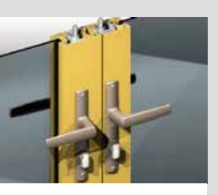
A full range of hardware available including 4-point locking mechanisms. ANDO<sup>™</sup> lever furniture illustrated. Available in powder coat or stainless steel finish.