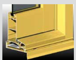
A variety of thresholds to suit different applications.