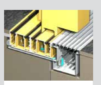
The sliding door detail shown above is ideal for high-end residential or commercial applications where you want a low flat sill that will keep water out.