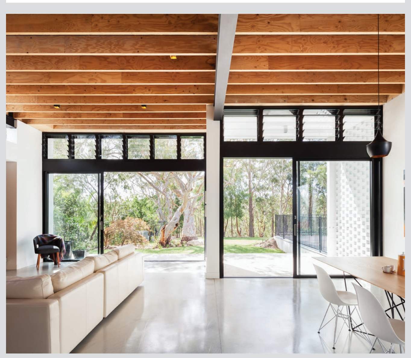
/Turramurra House. Architect: Noxon Giffen. Windows by: Great Lakes.

Due to the fundamental shift in the building industry toward green building, AWS released a Thermally Broken range of Aluminium frames. The Designer Series ThermalHEART™ range offers up to 32% better thermal performance than standard double glazed aluminium frames and is the first suite of products of its kind designed specifically for the Australian climate.