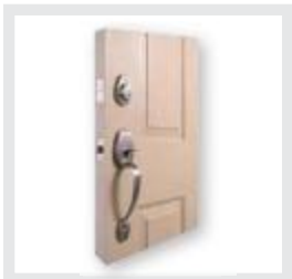
Ultra Round, brushed nickel finish solid brass gripset with internal knob