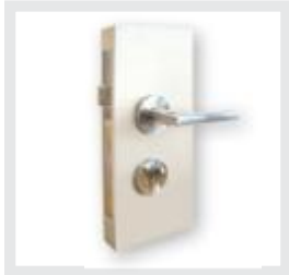
Passion Square lever handle set

All sets include lock & key. Pull handles in stainless steel, and other furniture in brushed nickel.