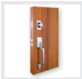
Deluxe Square, brushed nickel finish solid brass gripset with internal knob

Parkwood offer a range of hardware options to further enhance your entranceway, from the popular gripset to modern pull handles and lock sets.