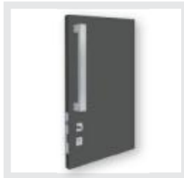
Regal 450mm or 600mm square pull handle & lock kit