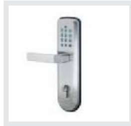
Digital lock - Qube 1342BN