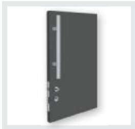
Colonel 450mm or 600mm round pull handle & lock kit