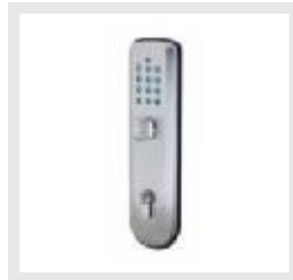
Digital lock - Thumb turn 1340BN