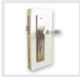
Zest Square lever handle set